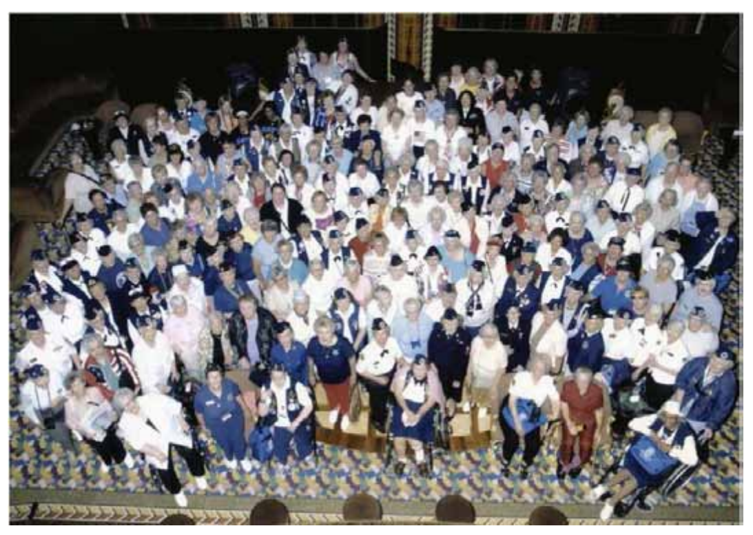
Image 6. WAVES National Convention Group Shot, Caribbean Sea, 22 September 2006<sup>135</sup>

Perhaps the women did not want a WAVES and SPARs memorial as World War II came to a close because they had been so well integrated into the wartime family and thus it would have seemed redundant to honour only women; instead a full Navy memorial would do. It was only after the war ended that they realized that their silence led their contributions to be overlooked. So they began to reassert their military family ties. They attended WAVES National conventions and successfully pushed for a memorial for female veterans in Washington, D.C.