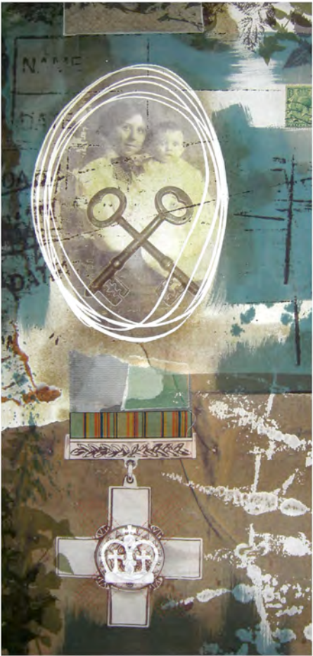
Figure 3: Left: details of digital additions to the collage background. Right: with additional screen print, stitch and bonded fabric additions.

The physical separation of the narrative into three panels for 'The Ties That Bind (I)' enabled a staged construction of meaning to be established for the viewer. The family photographs were a vital element in the construction of this visual narrative. However, the encoded authorial intentions for the images relied heavily on their compositional juxtaposition with other elements to create meaning beyond basic significations of the maternal or familial. A visual syntagm had to be created in the first panel to communicate that the family had been singled out for their pacifist beliefs in wartime. This began by positioning beneath the mother and child a crossed-out medal to connote lack of bravery, and by positioning the pattern for a military uniform over the image of another female relative from the period (Figure 3). Stamps were included to identify the period