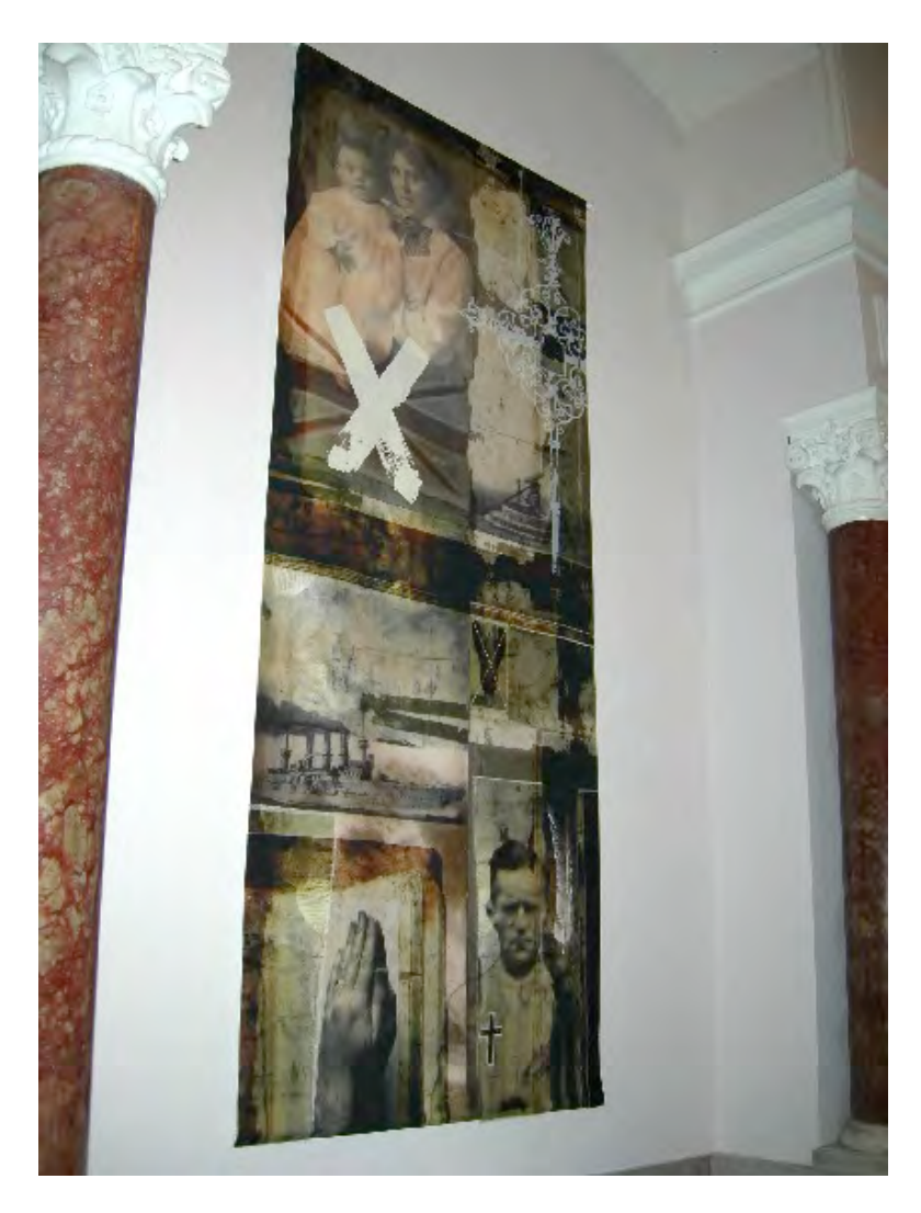
Figure 9: ' The Ties That Bind (II)' Panel 1'.

misinterpreted the flag as a gate. At a primary level of signification <sup>12</sup> the flag did denote 'British', 'national' and 'country' to most viewers. The secondary level of signification, the connotative meaning viewers interpreted from the image, was split between negative and positive associations. These included: "Ambiguity of serving England, propaganda," "Rejection of nationalism," "Rejected by church and country,' and conversely, "Flying the flag for Britain" and "Patriotism, home."