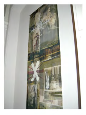
Figure 6: 'The Ties That Bind (II)' in situ at the Bankfield Museum and Art Gallery.