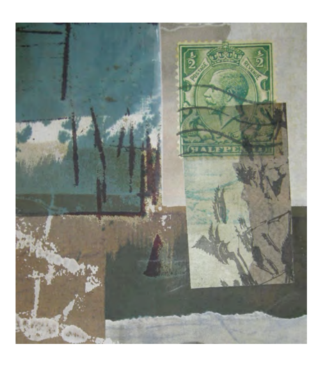
Figure 4: Stamp detail from 'The Ties That Bind (I)'. Image copyright of the artist.

and connote 'for king and country' (Figure 4). White crosses, incorporated as symbols of Christian faith, emerged as common elements across all the panels as the work progressed. Additional elements such as a white feather (a symbol of cowardice), and keys to symbolise imprisonment and release, were also included to develop the narrative content.