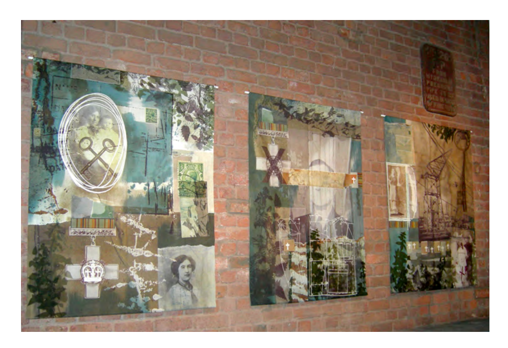
Figure 5: 'The Ties That Bind (I)' in situ at Manchester Museum of Science and Industry. Image copyright of the artist.

The textiles were exhibited at UK sites, deliberately without provision of a title or content description. The 'Ties That Bind (I)' was displayed in 2007 at Walford Mill in Dorset (a contemporary craft gallery), Lloyds Bank headquarters in Birmingham, Manchester Museum of Science and Industry (Figure 5), and Saltaire United Reformed Church. Self-administered questionnaires were placed with the installation and the researcher also undertook one-to-one voice recorded interviews with 46 participants at the sites. The 'Ties That Bind (II)', a reworking of the visual narrative, was later displayed in 2008 at Manchester Museum of Science and Industry and the Bankfield Museum and Art Gallery, West Yorkshire (Figure 6). Self-administered questionnaires were again available with the installation.