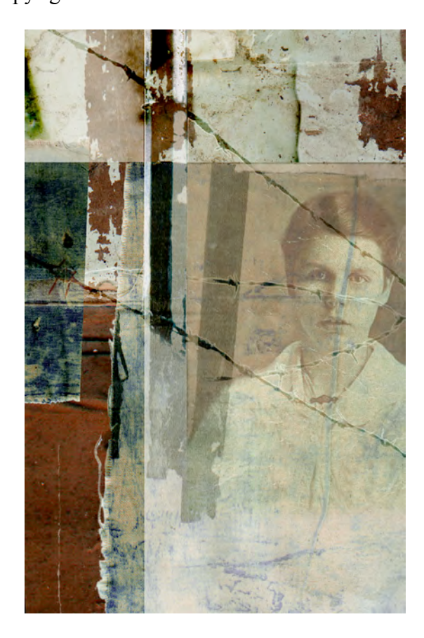
Figure 7: Image detail from the development of the 'The Ties That Bind (II)' centre panel.