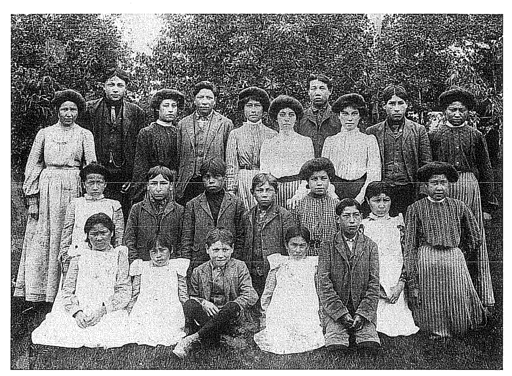
Indian children from Fisher River, Portage La Prairie Indian Boarding School, c. 1890s (93.049P/1749N).

Narrative Wisps of the Ochekwi Sipi Past: A Journey in Recovering Collective Memories