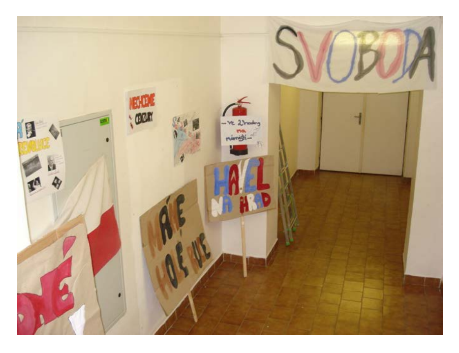
Figure 4. The school corridor where students displayed their oral history products, including banners with slogans and posters depicting witness statements. The sign above the door shouts "Freedom!"

Students decided to turn their Year 1989 oral and written sources into visual museum exhibits. They became excited about the creative potential of the project, discussing possible venues for presenting their findings. Students realized they might highlight witnesses' experiences and knowledge in the form of leaflets, posters, banners, or slogans. Flag displays, political signs, and photographs also could enhance instructional displays.