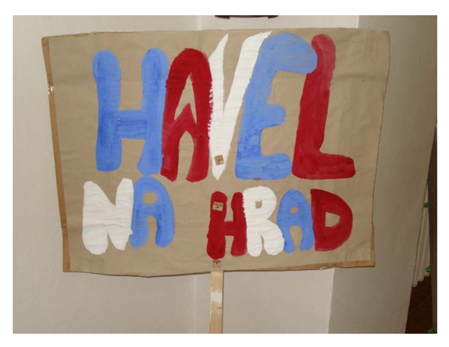
Figure 3. A banner proclaiming "Havel for President." Czech citizens wanted to elect their own president, an act forbidden under the Communist regime. The banner is a reminder that, following the 1989 Velvet Revolution, a free election was held and Havel was elected president of the newly formed Czech Republic.

Two witnesses visited the school to talk about their memories of November 1989 and what they recalled of their own lives at the time. Prior to witnesses' visit, students developed an interview questionnaire. While these students also used at least 10 questions to guide their research, they soon realized they would have limited time to conduct interviews during each witness' classroom visit. Final interview questions included: