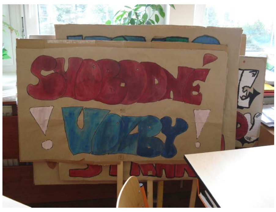
Figure 2. A student-made banner saying "Free Election," which was the password Czech citizens uttered to show their solidarity during the November 1989 Velvet Revolution.

Students began to visualize their project as consisting of two parts: use of primary sources and use of secondary sources. Lucie provided training in interview techniques, having students practice on one another in the classroom until they became comfortable with asking questions and waiting for complete answers, using prompts to facilitate elaboration, and using probing questions when needed.