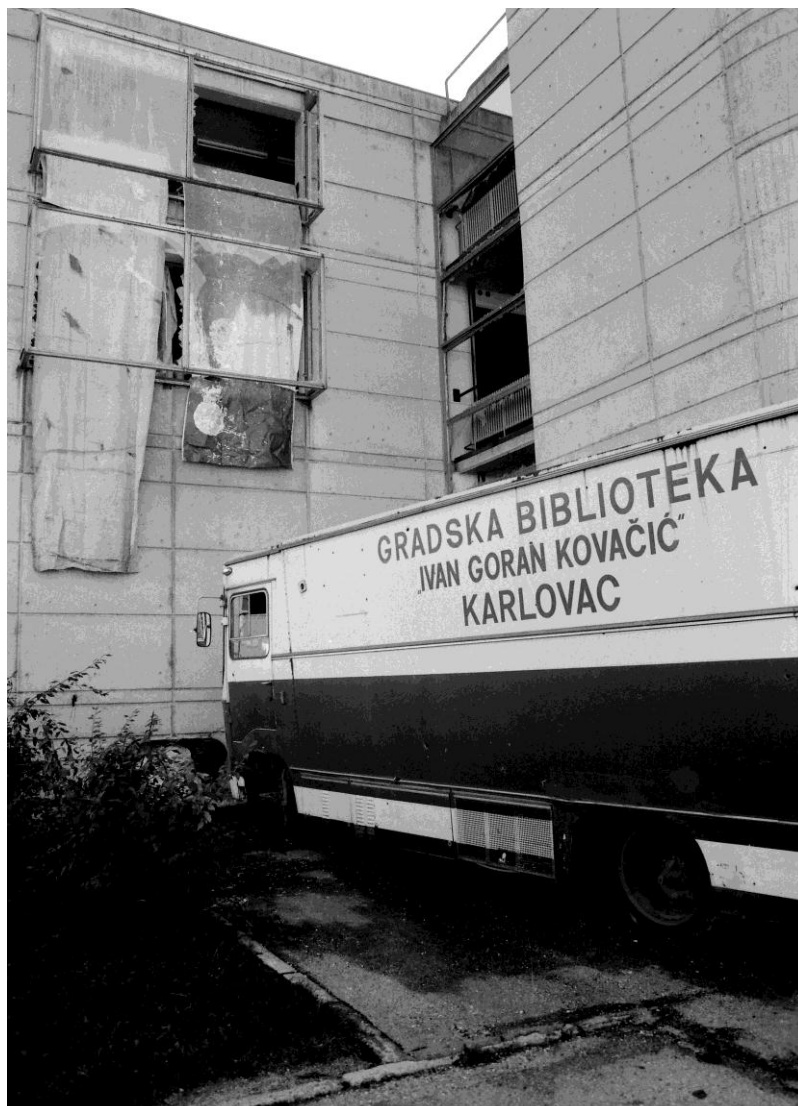
Fig. 5. The bookmobile at the Karlovac city library. Dubrovnik library archives.