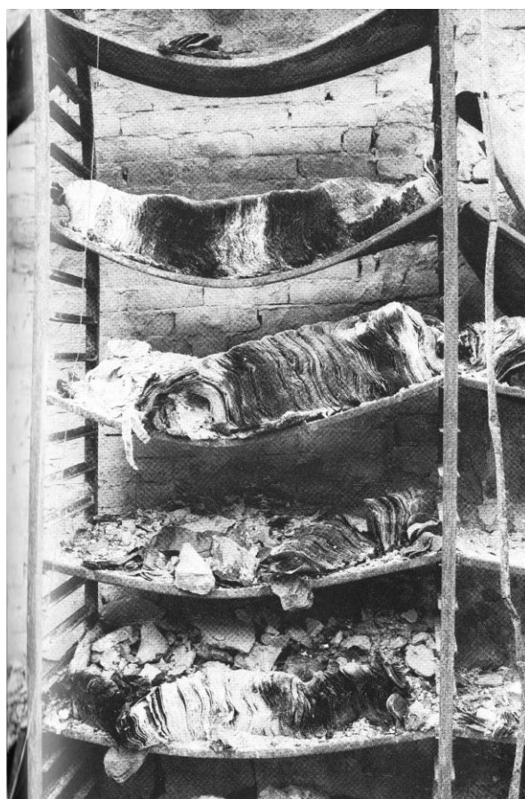
Fig. 4. Burned books in the City Library at Vinkovci.

Spacva timber industry, in which we thought, some important material could be stored. But what happened ... at first the crates were used for carrying discarded books down to the basement temporarily. Unfortunately, they remained in the basement, but in the state they were in, and were intended for the boiler. Then we had a terrible attack ... and because of individual politicians and historians... our director had to quit just because it turned out that we preserved Serbian books... but see how it happened so spontaneously. (Lb19, Vinkovci)