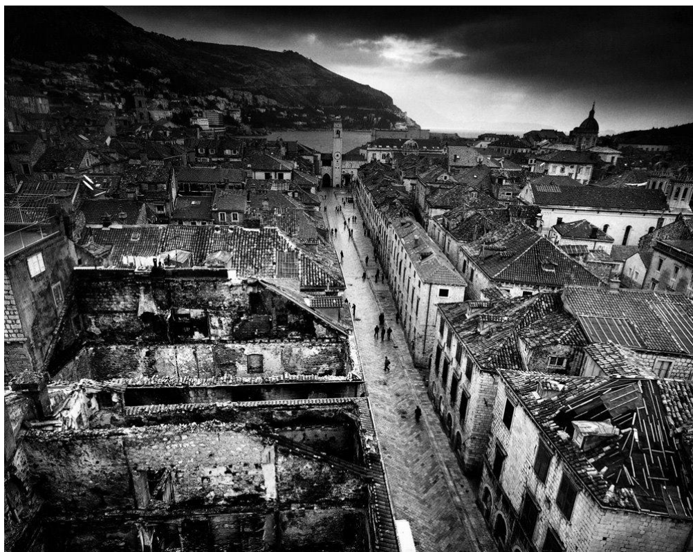
Fig. 1: Unknown author, “Old town of Dubrovnik after shelling.”